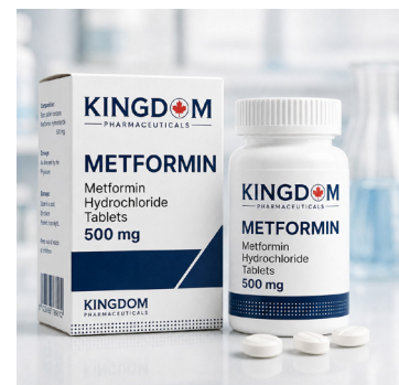
Metformin 500 mg