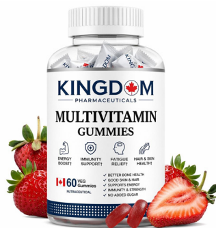
Gummy Range Overview Multi-product wellness line