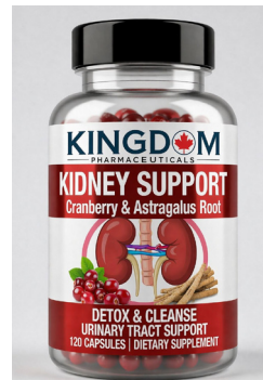
Paracetamol Suspension Pediatric syrup concept