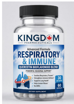
Omeprazole 20 mg Delayed release capsule concept

Packaging references and generated mockups to help clients visualize the Kingdom Pharma product family.