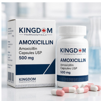
Amoxicillin 500 mg