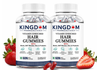
Amoxicillin Product Visual Original reference product style