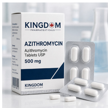
Azithromycin 500 mg